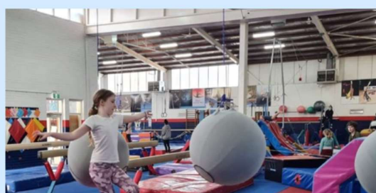
NIMBLE NINJAS Thursday 30th September 1:30-3:30pm

KINDER AGED PROGRAMS (12 MONTHS - 4 YEAR OLD KINDER) $10, $5 FOR SIBLINGS