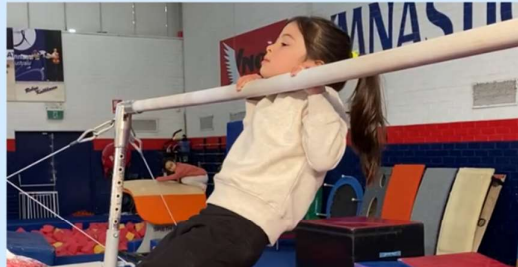
BRAVE BARS Thursday 22nd September 10am-12pm