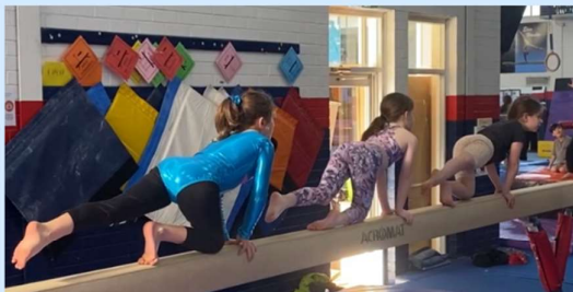
BEDAZZLING BALANCE Tuesday 20th September 10am-12pm

$20 per session Primary School Aged Children (5-12 years)