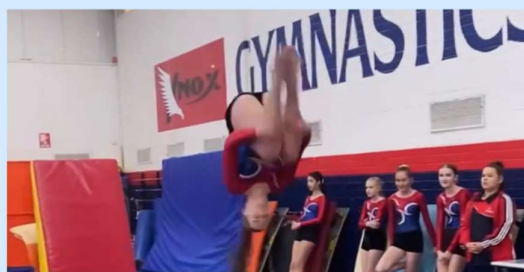
SENSATIONAL SOMERSAULTS Tuesday 27th September 1:30-3:30pm